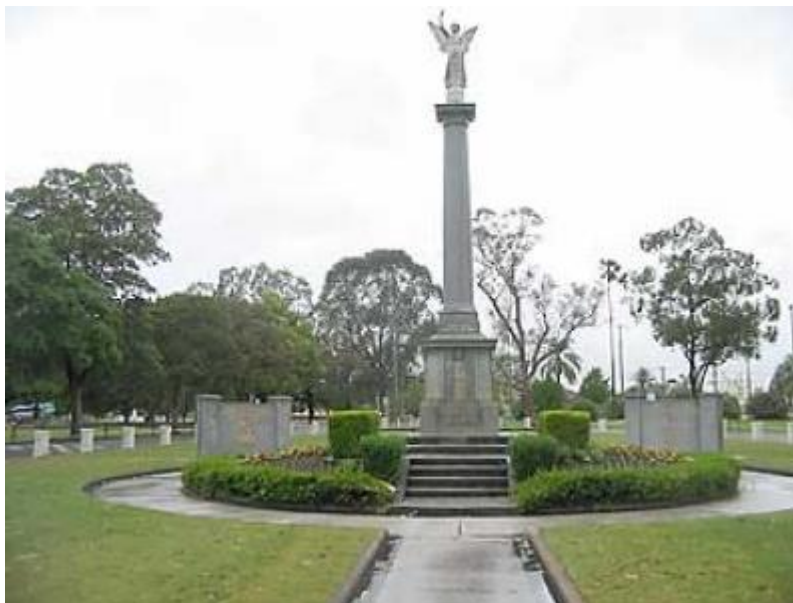
Maitland World War 1 Cenotaph